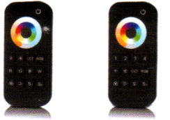
RT5 1 Zone RGB+CCT RT10 4 Zone RGB+CCT

1 and 4 zone RGB+CCT/Touch color wheel/Wireless remote 30m distance/AAAx2 battery/Magnet stuck fix